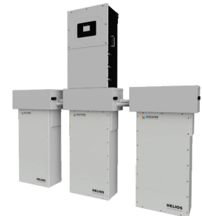
Inverter not included. For illustration purposes only.

a. If 2/0 AWG is oversized for the application / b. If lifting assistance is needed / c. If installation requires longer cables / d. Required for integration with LYNK Cloud for remote monitoring, programmable relays and closed-loop communication with Schneider, SMA and other inverter chargers.