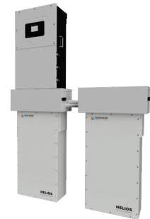
Inverter not included. For illustration purposes only.

a. If 2/0 AWG is oversized for the application / b. If lifting assistance is needed / c. If installation requires longer cables / d. Required for integration with LYNK Cloud for remote monitoring, programmable relays and closed-loop communication with Schneider, SMA and other inverter chargers.